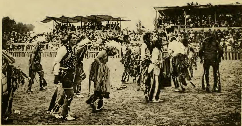
INDIAN WAR DANCE.